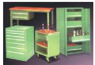
Shop Floor Equipment