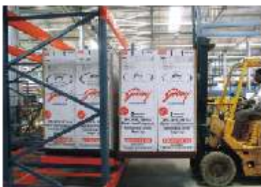
Push back Racking

UAE: 00 971 6557 0866 Sri Lanka: 00 9411 269 9600 Saudi Arabia: 00 966 1 4020 5345