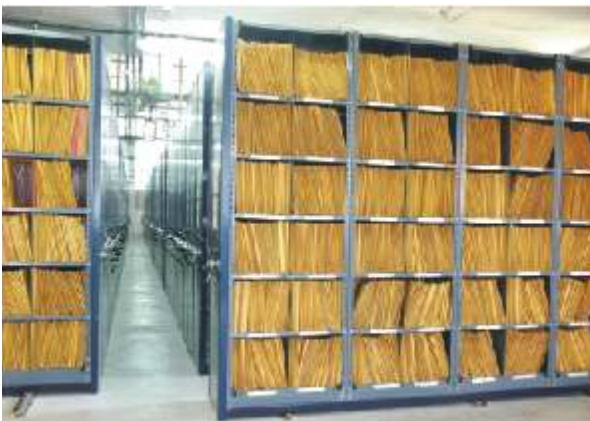
Bulk Document Storage