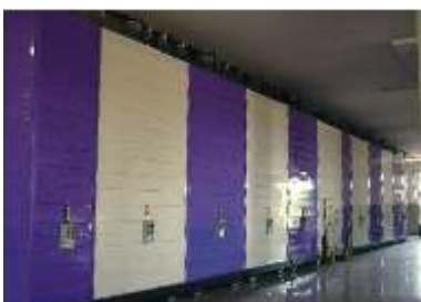
Mobile Pallet Racking