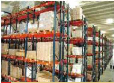
Selective Pallet Racking