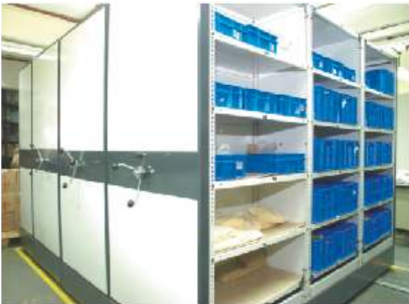
Perishable Goods Storage

Godrej Mobistack virtually doubles your storage capacity. Ideal for high density industrial storage applications, excellent flexibility, functionality and aesthetics are added features of this space saving system. This is ideal for storing files, stationary, documents, tapes, computer disks, perishable goods, laboratory equipment etc. The effort required for the movement of the storage unit is about 0.05% of the dead load.