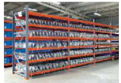
Heavy Duty Shelving