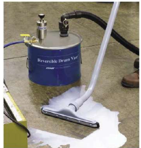
Model 6901 Spill Recovery Kit used with the Mini Reversible Drum Vac provides fast cleanup of messy spills.

EXAIR's Mini Reversible Drum Vac allows for quick and easy clean up of small messes.