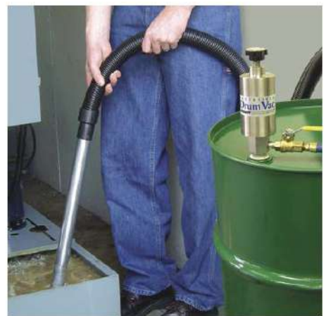
Reversible Drum Vacs are designed to fit the 3/4 NPT bung of any closed top drum. This model 6196-30 30 gallon system empties the coolant sump of a CNC.